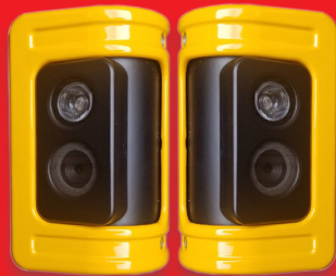
HD Stop Arm Camera System

“Safety Vision ...has surpassed my hopes for stop arm violations support.”